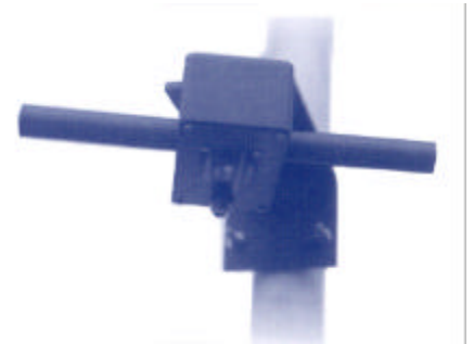
NLA/1 Active Ferrite Loop Antenna

Tuning: Adjustable links Frequency Range: 190 to 535 kHz Effective Height: 0.2 meters Useable Signal Range: 50 \mu\text{V} /meter to 2.5V/meter (in conjunction with NRB) Output Impedance: 50 ohms (type "N" connector) Pattern: Figure-of eight (allows notching out of high level interfering signals) Power Requirements: + 12V DC at 50mA phantom fed on RF cable from NRB Environmental Limits: -50°C to +55°C, 0 to 100% relative humidity Mounting, Bracket: provided for mounting on a flat vertical surface or a vertical 2.5 inch diameter pipe Dimension (with bracket): 30 x 9 x 25 cm 12 x 3.5 x 10 in