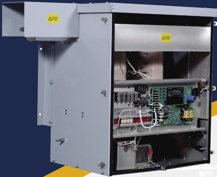
ATU-HP Antenna Tuning Unit